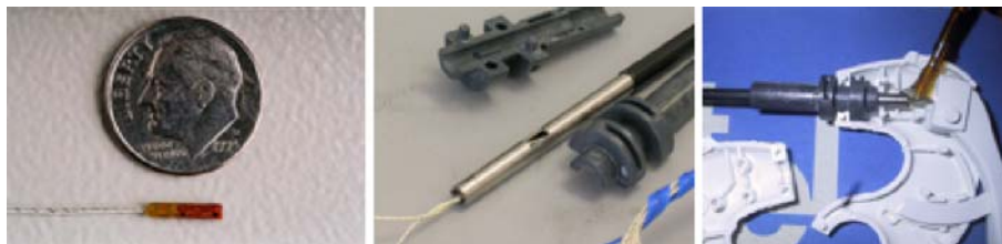
Fig. 1 The Ascension microBird magnetic sensor (left) and two photographs of the sensor's installation into the Ethicon instrument