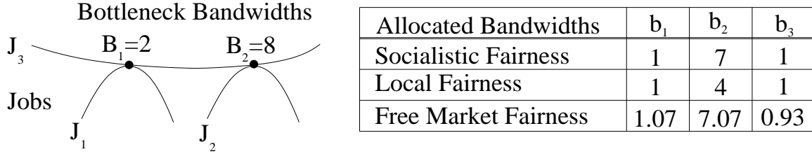
Figure 3: The following example demonstrates Socialistic, Local, and Free Market Fairness. There are two bottlenecks with capacities B_1 = 2 and B_2 = 8 . There are three jobs with J_1 passing through B_1 , J_2 through B_2 and J_3 through both. Socialistic Fairness allocates b_1 = b_3 = 1 bandwidth to jobs J_1 and J_3 , fairly splitting the bandwidth of B_1 = 2 . Job J_2 is given the remaining B_2 bandwidth b_2 = B_2 - b_3 = 8 - 1 = 7 because doing so does not hurt the other jobs. Local Fairness allocation is the same in this example, except that J_2 is only given his fair share of B_2 's bandwidth which is b_2 = \frac{B_2}{n_2} = \frac{8}{2} = 4 . Note that the second bottleneck has B_2 - b_2 - b_3 = 8 - 4 - 1 = 3 bandwidth left unused. AIMDEQUI or Free Market Fairness allocates price f_1 to the bandwidth of the first bottleneck and f_2 to that of the second. The key requirements are that the bottlenecks are at capacity, giving b_1 + b_3 = B_1 = 2 and b_2 + b_3 = B_2 = 8 and that all players pay the same for their bandwidth giving that f_1 \cdot b_1 = f_2 \cdot b_2 = (f_1 + f_2) \cdot b_3 = \frac{\alpha}{(1-\beta)} . Changing this constant, simply scales the prices and hence wlog \frac{\alpha}{(1-\beta)} = 1 . This gives us a total of 2 + 3 = 5 equations and 2 + 3 = 5 unknowns. Solving them gives us that the price for the bandwidths are f_1 = 0.96 and f_2 = 0.14 . Note that as expected the bandwidth through B_1 is much more expensive because there is less of it. J_3 gets b_3 = 0.93 bandwidth, which is less than the others because he is paying more. This leaves b_1 = 1.07 and b_2 = 7.07 for the other jobs.

is \mathcal{O}(m^2) -speed \mathcal{O}(m) -competitive. The same result automatically applies for SEQUI because it never allocates less bandwidth to any job. Lemma 3 proves that AIMDEQUI allocates at least \frac{1}{m} as much. Theorem 2, stating that AIMDEQUI is \mathcal{O}(m^3) -speed \mathcal{O}(m) -competitive, follows.