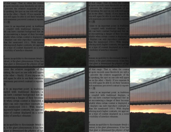
Figure 1. Simulated screenshots of the HDR display

We demonstrate the ideas presented by considering a problematic high contrast edge that arises when a bright HDR image is located near a page of text in the user interface. Figure 2 shows a simulated picture of how the human visual system would perceive this kind of high contrast edge with and without our correction. Applying the correction improves visibility of the part of the text immediately next to the image by reducing local contrast.