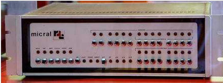
Fig. 4. R2E's Micral S computer (1973).

In early 1974, R2E released its new Micral—the Micral S—which was designed for personal use.