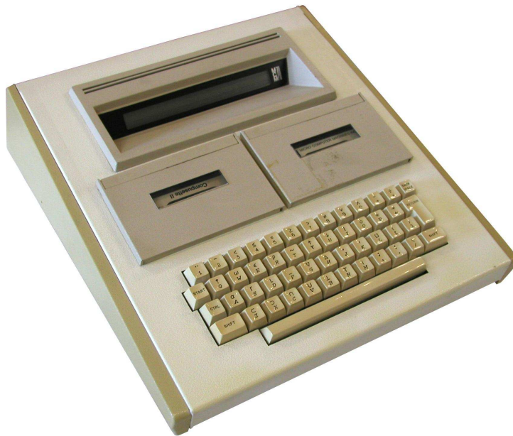
Fig. 1. The MCM/70 computer designed and manufactured by the Toronto-based Micro Computer Machines (1973).