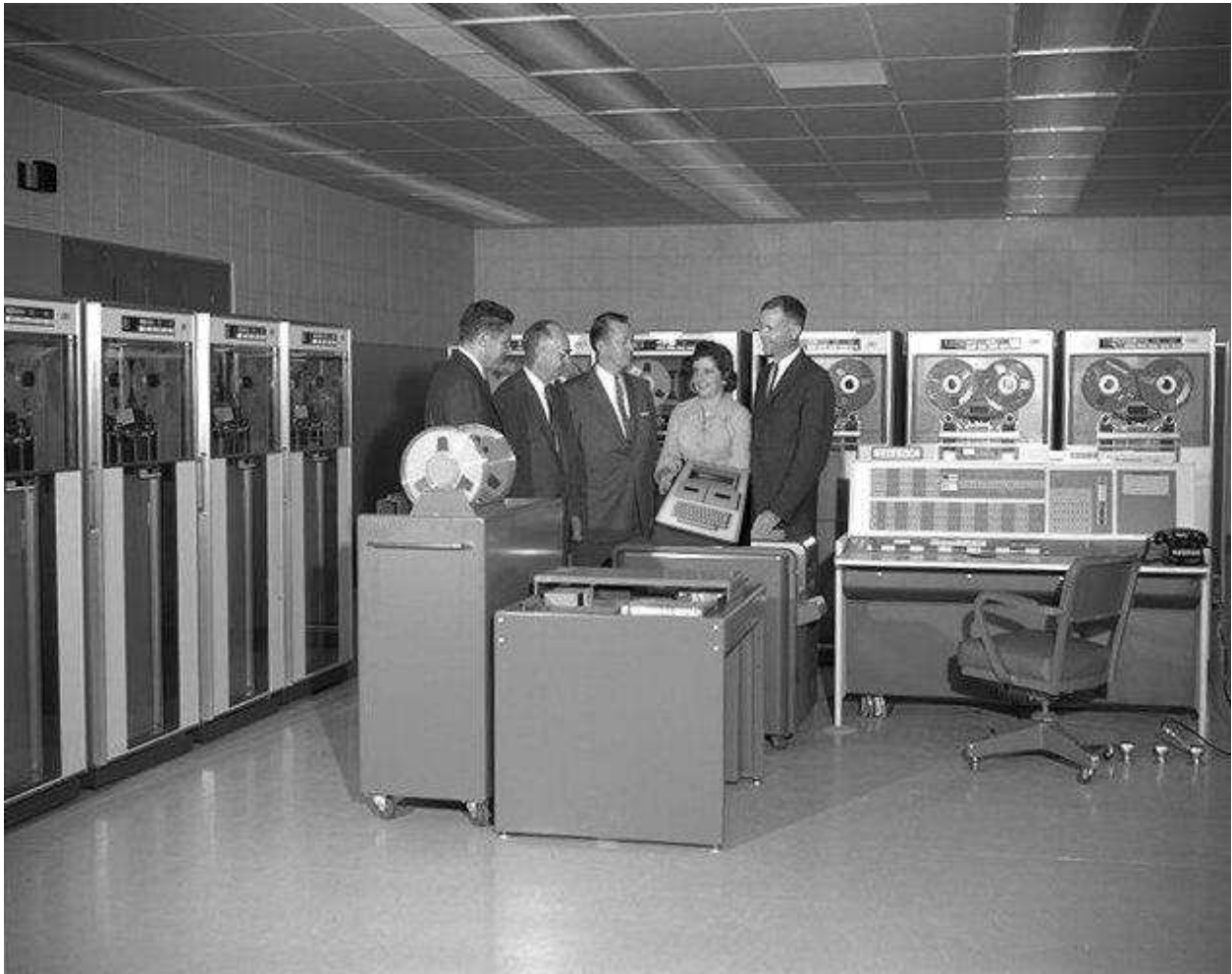
Fig. 3. Faked image of IBM executives comparing the MCM/70 to the company's 7090 mainframe computer.

The "Small Canadian", as the MCM/70 was referred to by some media in Europe, awakened society to the real possibility of universal and affordable access to computing in the not-so-distant future. Indeed, a compact, all-in-one MCM/70 displayed next to a refrigerator-sized minicomputer during a computer show provided the first glimpse of a new computing paradigm based on individual use and ownership.