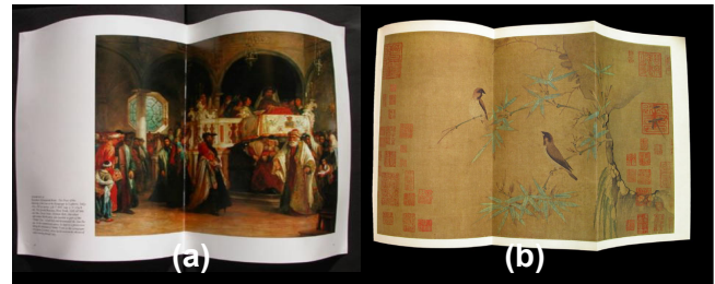
Figure 1: Examples of image distortion. (a) book binder distortion (b) a more complex example of a three page fold-out.

Copyright 2000 ACM 1-58113-000-0/00/0000...$5.00.