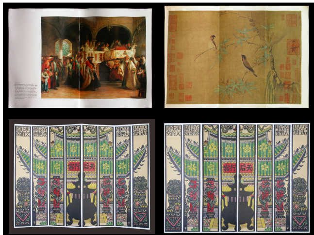
Figure 3: Results from three examples. (Top) Correction of two over-sized books imaged by a camera (from Figure 1). The first corrects binder distortion. The second corrects both binder and fold distortion. (Bottom) A Chinese paper-cut on a folded tablet - before and after correction.

Figure 3 shows results of our approach on three examples. The first two are the examples shown in Figure 1. These are pages (including a three-page fold-out) from two oversized books. The last image is of a 2.5x1 meter Chinese paper cut. This medium is pasted on a folded tablet. To fit inside the display case, the item cannot be completely unfolded, which is apparent in the image. Our approach is able to correct these different distortions.